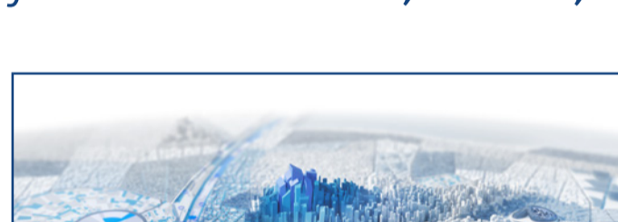
Architecture, Engineering, and Construction Collection

Get the most out of your favourite software. Industry collections combine leading products with specialized solutions to optimize your workflows so you can do more, faster, with greater confidence .